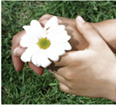
This image was funded by the Substance Abuse and Mental Health Services Administration (SAMHSA), US Department of Health and Human Services (HHS). The views, policies, and opinions expressed are those of the authors and do not necessarily reflect those of SAMHSA or HHS.