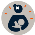
Mother treated violently